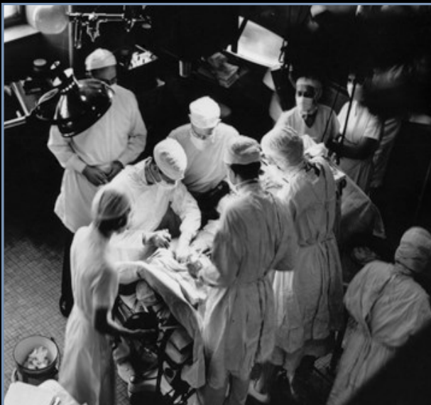
Vivien Thomas, top left, stands behind Dr. Alfred Blalock during an early operation at Johns Hopkins.